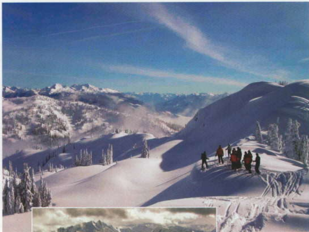
(Top) Heaven on a skier's earth (middle) The Selkirk Mountain Range in British Columbia — the home of legendary snowcat skiing (bottom) Crazy Eights — cat ski style

Brenda Drury, had an inkling this snow-laden interior valley was prime powder real estate when they pioneered the sport in the late 70s. The Selkirk mountain range is characterized by consistent snowfall (600-800" annually), very little wind and relatively moderate temperatures — conditions powder skiers world-wide have come to identify as the pinnacle in wilderness deep snow skiing. These pristine peaks offer skiers an expansive and varied terrain of wide-open bowls, well-spread trees, steep chutes and gentle slopes at a relaxed, comfortable pace. No crowds or lift lines in this vast winter playground.