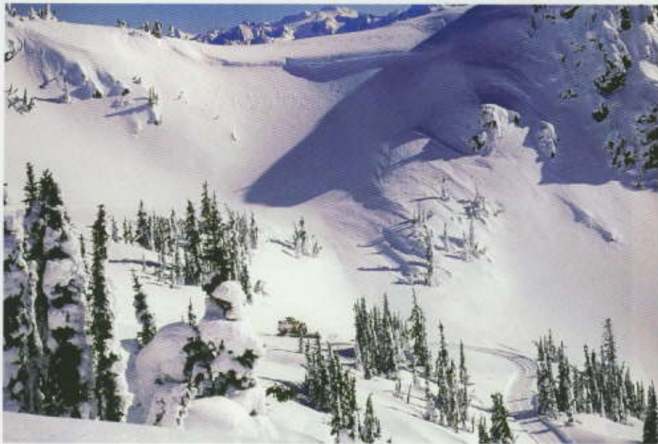
A snowcat chugs up to uncharted bowls of pristine powder

The snowcat season in British Columbia runs from mid-December to mid-April. Skiers should be of intermediate ability and be prepared for a wide range of snow qualities in both alpine and treed settings.