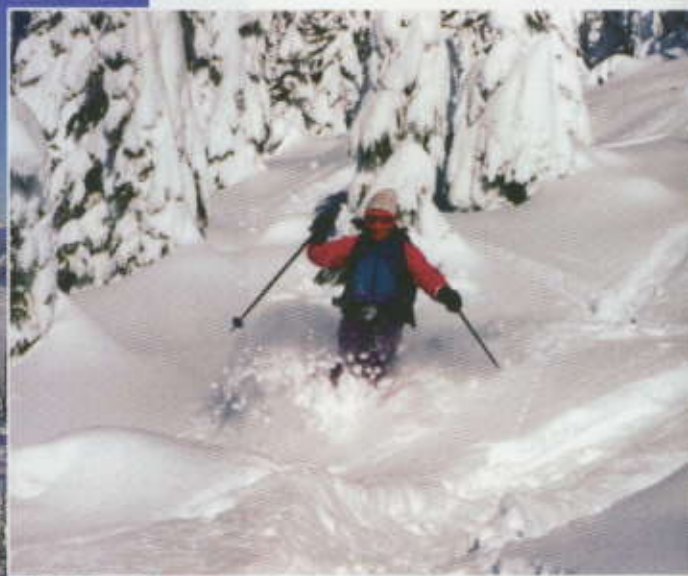
(Above) On top of the world, its not just a feeling (inset) Ego-snow-skiing through B.C. powder